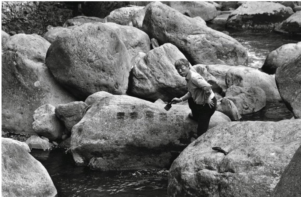
Lee Ufan painting on stone, Hakone Valley, Japan, 1998

The Art Gallery continues to celebrate the enduring legacy of key living artists that have shaped contemporary art with an extraordinary free exhibition this August by senior South Korean artist Lee Ufan . The Art Gallery is working directly with the France- and Japan-based artist to present an exhibition which distils over six decades of considered experimentation into a series of new paintings and sculptures.