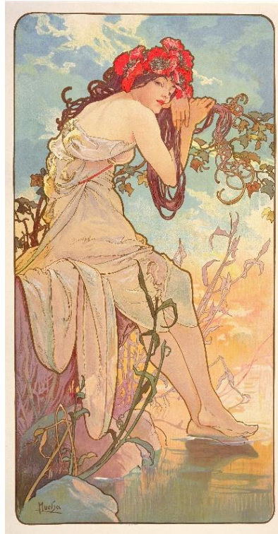
Alphonse Mucha The Seasons: Summer 1896, colour lithograph, 103 x 54 cm © Mucha Trust 2024

The Art Gallery of NSW releases first major program announcement for this year